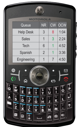
Web-based Dashboards give you access to data anywhere you have an Internet connection, including Smart Phones with Windows Mobile 5 or greater.

Vitals Dashboard is available as a thick-client application or through a web-based solution that requires no software installation, virtually no desktop support or maintenance, and is accessible from any computer with an Internet connection.