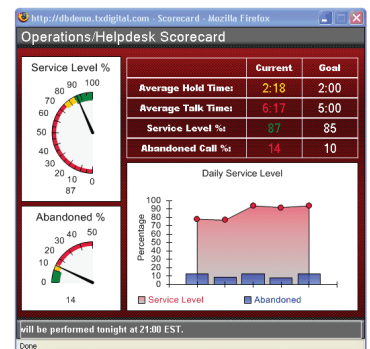
Scorecard-type reports give you an instant snapshot of critical business data.

Vitals Dashboard delivers performance data and business alerts through real-time, personalized dashboards that analyze and track vital information. You define the key indicators that will measure performance and success for various groups, and Vitals Dashboard pushes that data in real-time to drive continuous improvement and profitability. Graphs, charts and gauges combine for a visually rich, easy to read snapshot of your most important statistics.