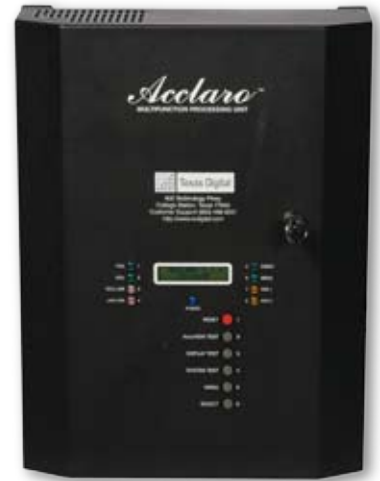
Acclaro Drive-Thru Timer

Acclaro measures speed-of-service accurately and automatically in addition to actively monitoring the store's POS, menu loop, window loop(s), and AccuVIEW displays. Data is accessible at the store through easy-to-view displays for the crew and managers, while reports are available to management from any location via a Web interface. Acclaro reports are available when you want them, where you want them.