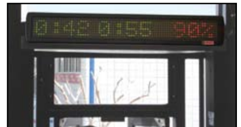
Manager's Display with Collected Data